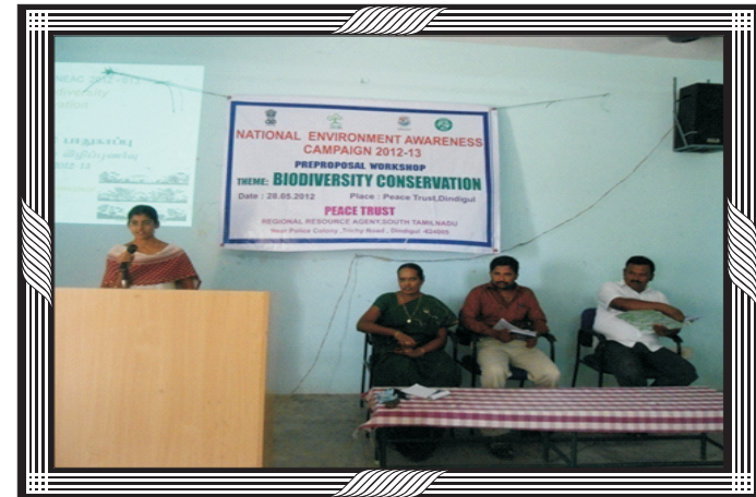
Funded by: Ministry of Environment & Forest Govt of India

For identifying potential participating organizations Peace Trust has consistent touch with 18 districts lie down at south parts of Tamil Nadu. To increase the number and the quality of the participating organization over the years Peace Trust has regularly conducting the training programme, workshop, mass media advertisement (like Press news and community Radio and Rainbow FM Radio) and through web sources. On an average Peace Trust involved 350 NGOs/year to be involved in the NEAC.