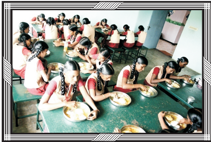
Funded by : Karl Kubel Stiftung, Strahlemann Initiative, Fraport Germany

We aim to redress the problems and issues of community more specifically towards the children who are affected by Natural disaster. The project takes off with a new dimension leading to sustainability track. By nature, it seems to be a post Tsunami response comes under Disaster reconstruction program. We have set out mission and other program activities based on the project evolution and fully rely on the need assessment.